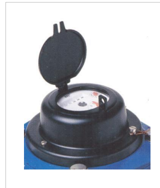
(1) Lockable lid

WMPA is woltmann meter for cold water 40°C of interchangeable Mechanism and axial helix type. (the axis of the helix coincides with that one the pipeline). The meter is supplied pre-set for 3 impulse outputs which can be easily activated after the installation of the meter itself. On request the meter can be produced with materials suitable for use with hot water up to 90°C. The dial is of dry type with magnetic transmission and straight reading on 7 numbered drums (max reading 10.000.000 m 3 ) for sizes 50-125 mm, on 8 numbered drums (100.000.000 m 3 ) for sizes 150-200 mm.